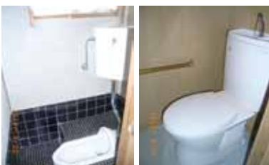
Remodeling of houses

We would like to support the disabled so that they can have independent living at home, work place, society as citizen. That's why we do various kinds of activities by that the disabled can act by own decision and make their own life by themselves.