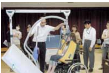
Seminar by equipment specialist