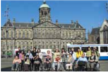
Tour to Nethealnds