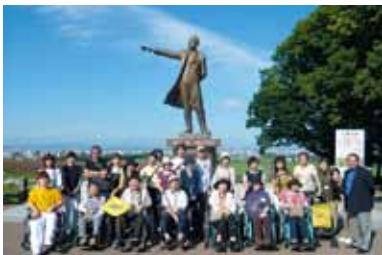
Tour to Hokkaido, Japan