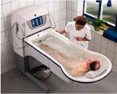
Special bathing equipment